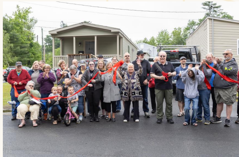
Cotton Farms, Derry, NH